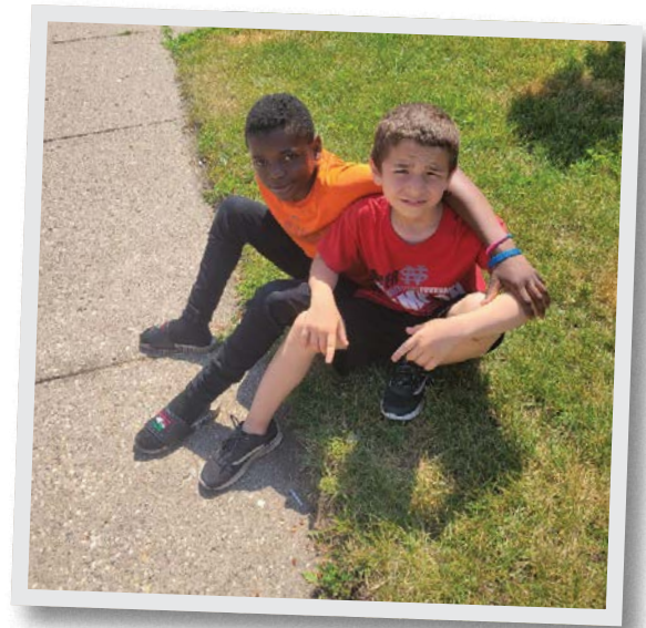
Two young boys showing the world love at the Community Love Fest

We are thankful for every ministry or organization that came alongside us in some way!!! We can't do what we do...without YOU!!!