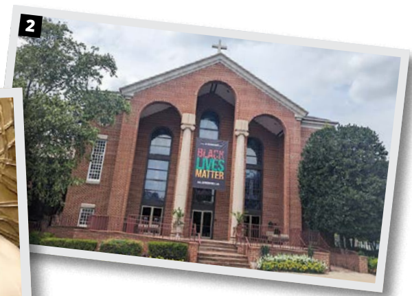
[2] Alfred Street Baptist Church